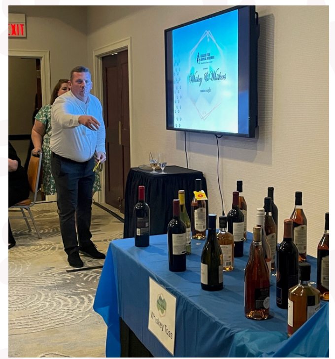
The popular Whiskey Toss will return this year - donate a bottle of whiskey and help save a cat's or dog's life!

The League can make unique auction items out of your treasures and talents! Reach out to us at info@lfaw.org for how to give to save lives!