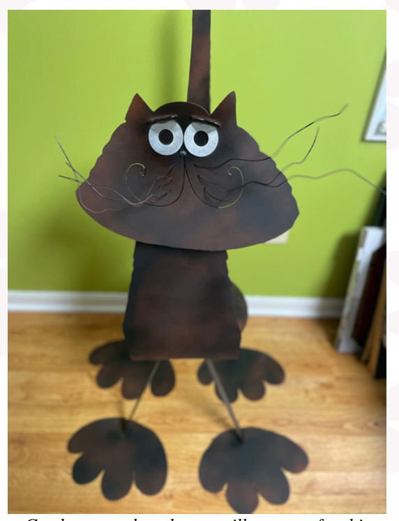
Gardeners and cat lovers will go gaga for this plant stand.

The 9th annual Whiskey & Whiskers is gearing up for its best year yet. Tickets have sold out in record time; sponsors have contributed more funds than ever before; and the evening is shaping up to be one for the books.