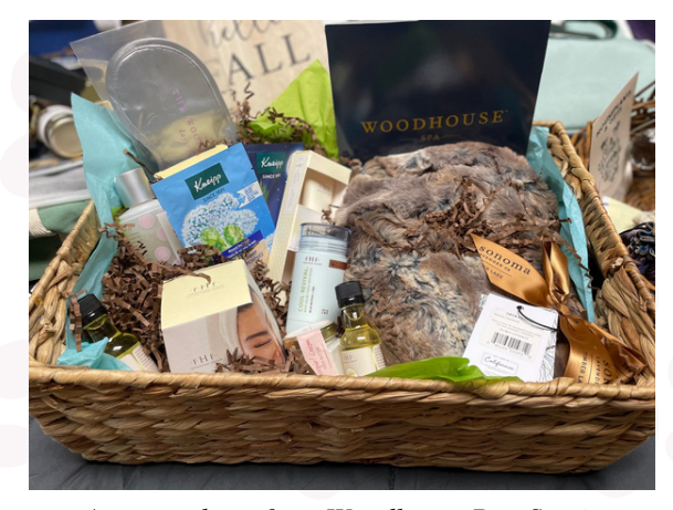
A spa package from Woodhouse Day Spa in Crestview Hills will make anyone feel better!

If you like to travel, there are luxurious trips to far-flung locales. Prefer to stay at home? Bid on a house-cleaning service! Fondue pots and grills for the home-cook; restaurant gift cards for the cooking-averse. Spa packages for the pampered; sports paraphernalia for the rugged. Tickets to FC Cincinnati or Kings Island for our local adventurers; a "road-tripper" basket for the adventures farther afield. From Kate Spade bags to Bourbons, from teeth whitening to Hummingbird feeders, the silent auction will have a little (or a lot!) of something for everyone!